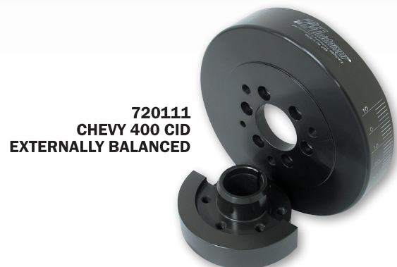
720111 CHEVY 400 CID EXTERNALLY BALANCED